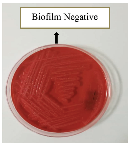
Figure 2. Red colonies negative biofilm

plates to determine whether they produced black colonies. For growth and biofilm formation, all control species were cultured on both blood agar and CRA. The isolates were then incubated at 37 °C for 24-48 hours.