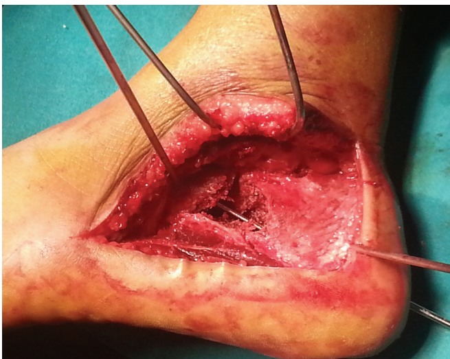
Figure 1. Lateral extensile approach

Böhler angle and crucial angle of Gissane were documented on preoperative and post-operative radiographs at the last follow-up. The comparison views were used for surgical guidance in restoring normal anatomy in the contralateral foot in the unilateral cases.