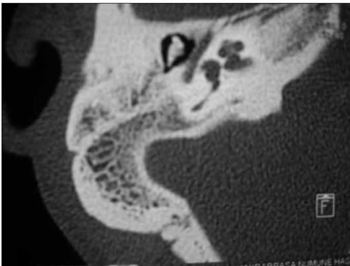
Figure 2. Axial CT scan of left temporal bone

of the mastoid process. The developmental process has been shown to be bilateral and symmetrical.